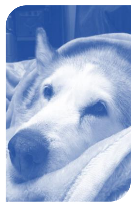
"Sick Malamute" by <u>redwolfoz</u> (CC BY-NC-SA 2.0)

If you miss a test or an assignment deadline, please do not contact the instructor or a TA unless you are following the steps described here (i.e. simply telling the professor or the TA why you missed a deadline or a test does not represent proper documentation):